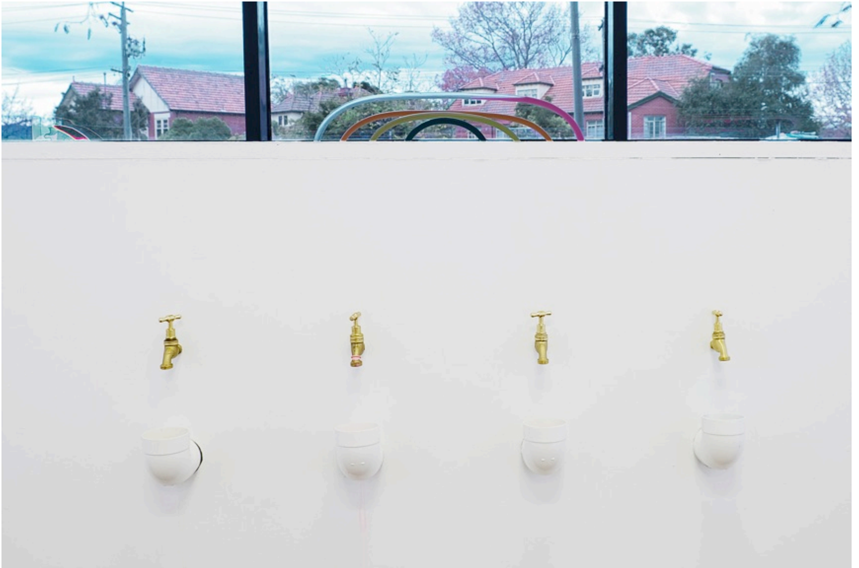
Fosset Installation View , taps, wood, pvc, plastic tubes, pumps, Project Space, 2016