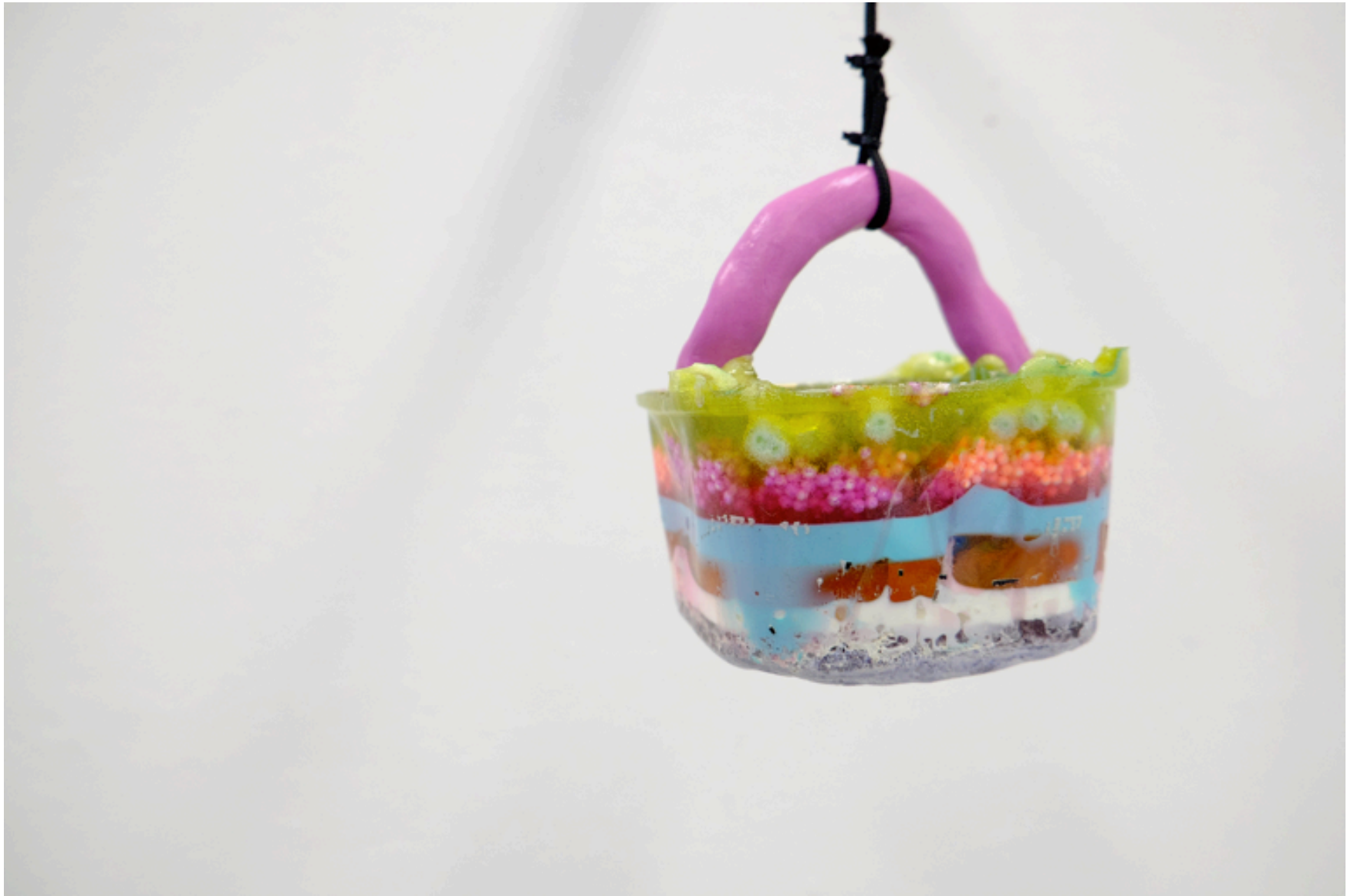
Introspective Paradigms , Detail, Silicon, resin, ice, MADA NOW, 2015