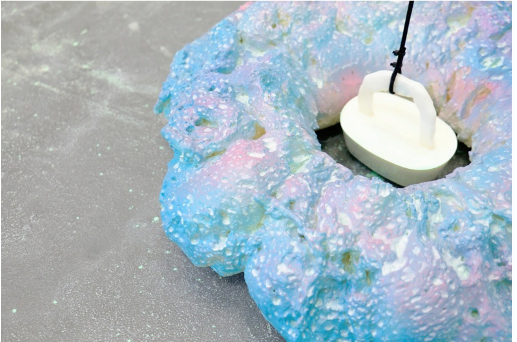
Introspective Paradigms , Detail, Resin, polyurethane, foam, paint, MADA NOW, 2015