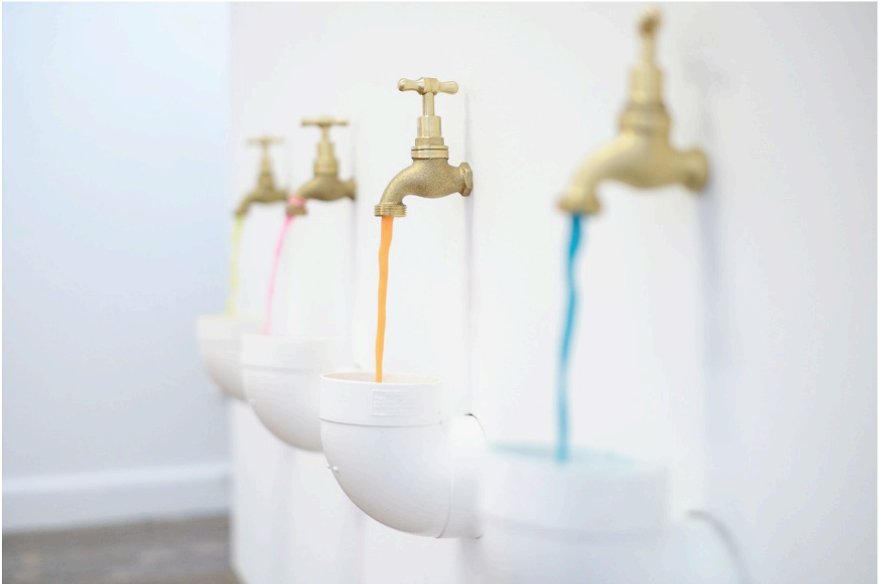
Fosset Detail , taps, wood, pvc, plastic tubes, pumps, paint, Project Space, 2016