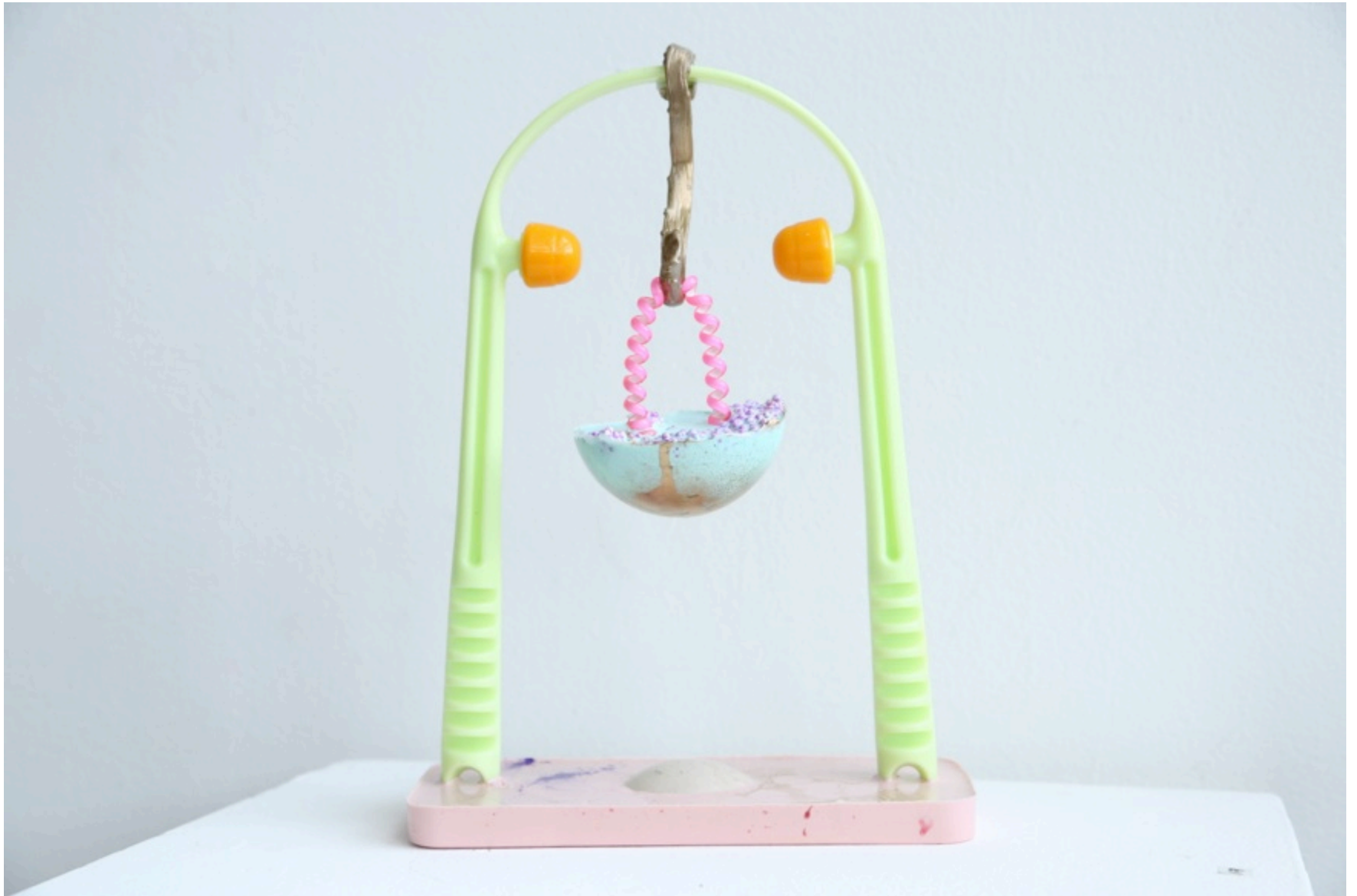
Blergh , Resin, polyurethane, found object, Honours Fundraiser Show, 2016