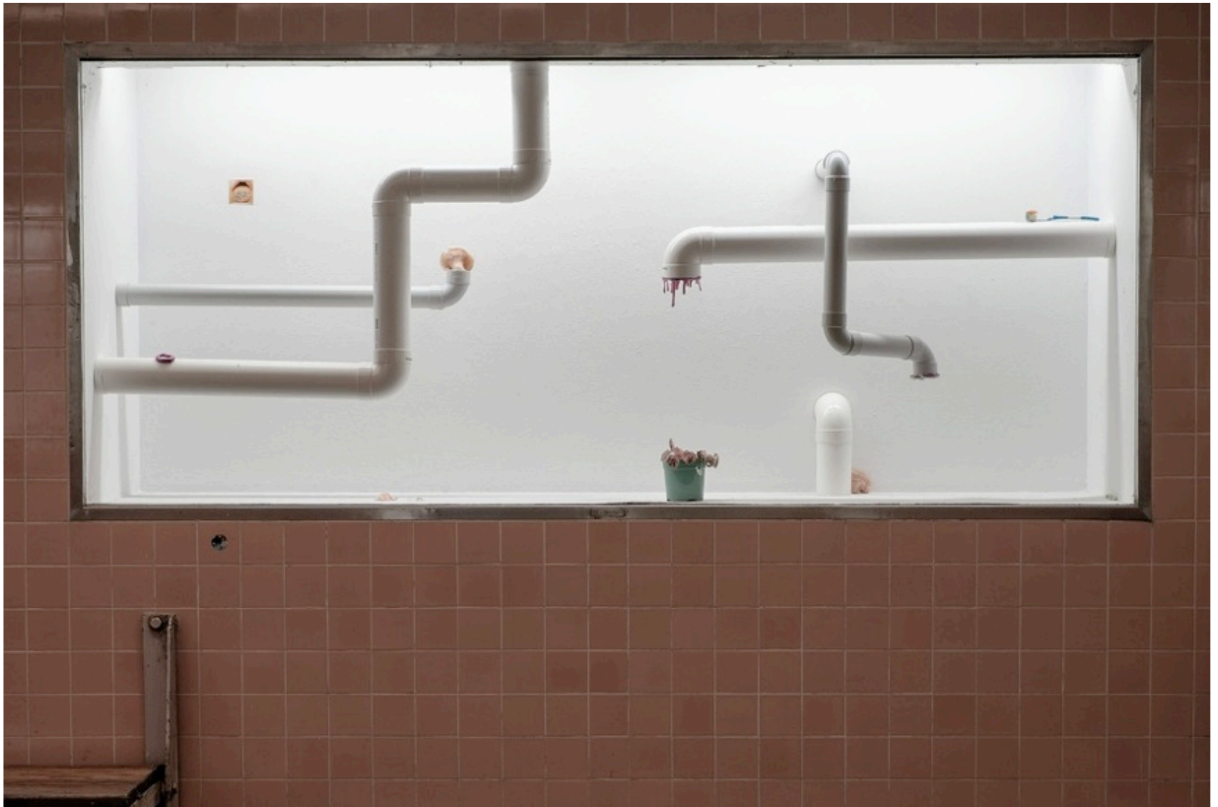
Windows XII Installation View , Collaboration with Laetitia Olivier-Gargano, Pvc, Natural Matter, Silicon, paper, Campbell Arcade, Flinders Street, 2016