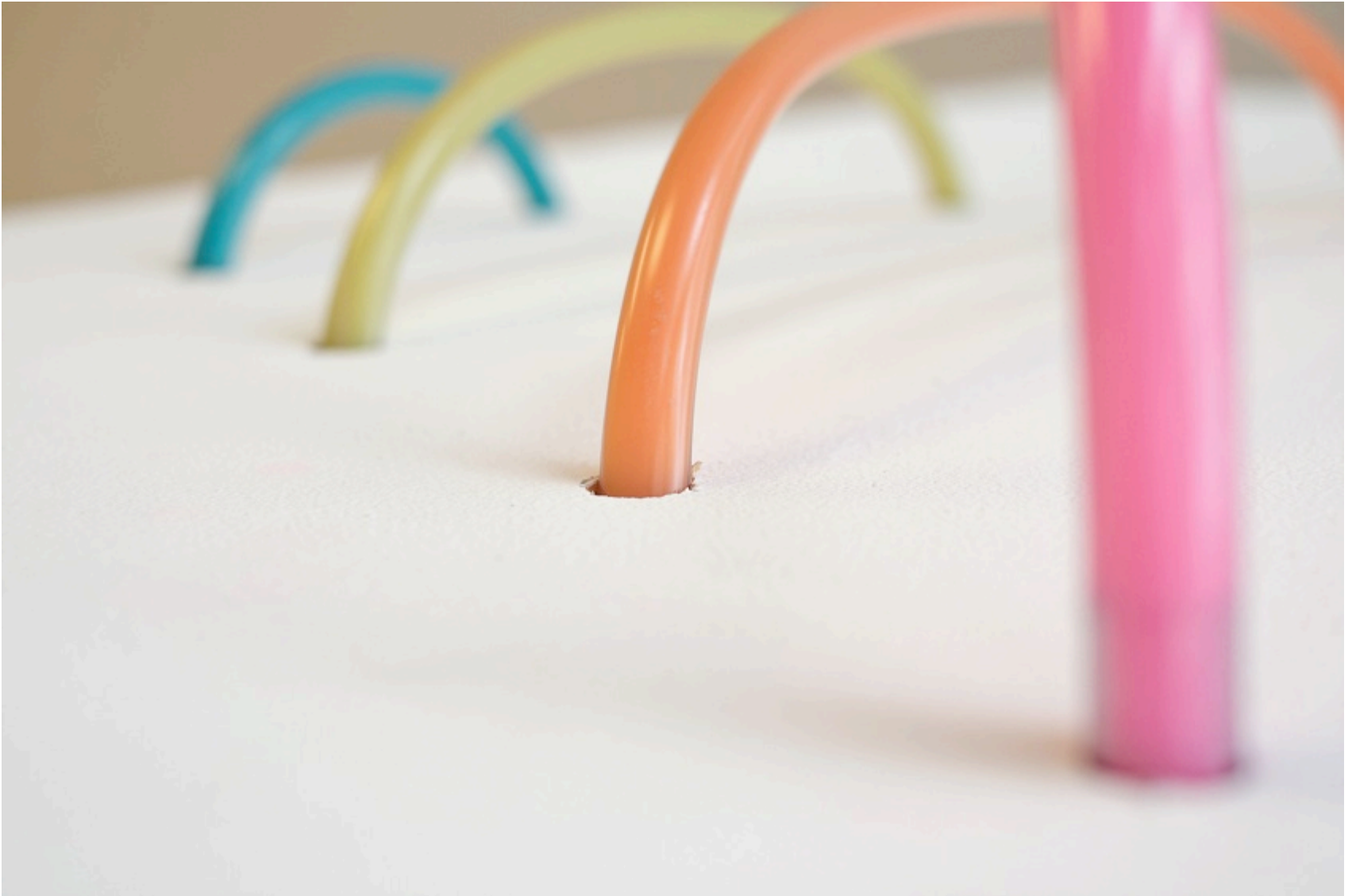
Fosset Detail , taps, wood, pvc, plastic tubes, pumps, paint, Project Space, 2016