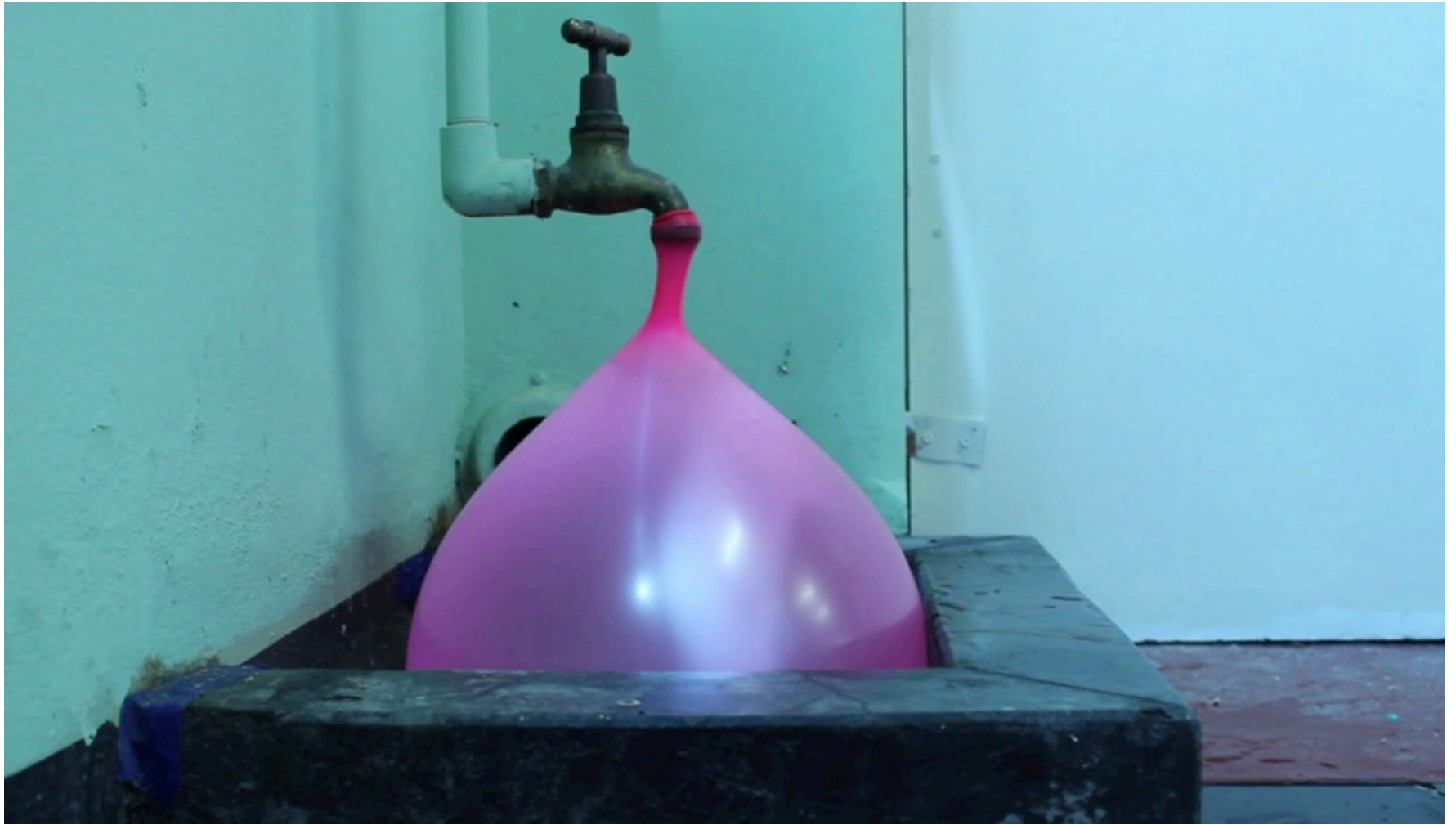
Pink Balloon , Video Still, Honours Studio, 2016