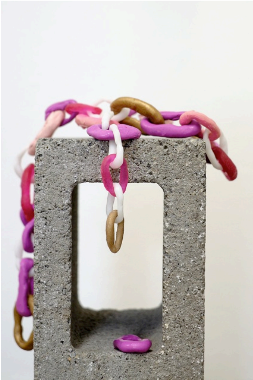
Rudimentary Tensions Detail , Cement block, ice, resin, silicon, polyurethane, Runt Link Gallery, 2016