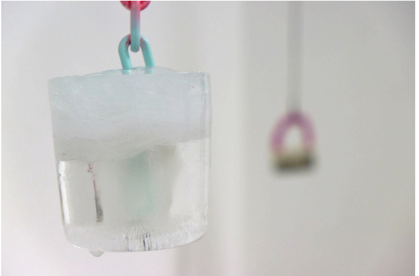
Rudimentary Tensions Detail , ice, resin, silicon, rope, Runt Link Gallery, 2016