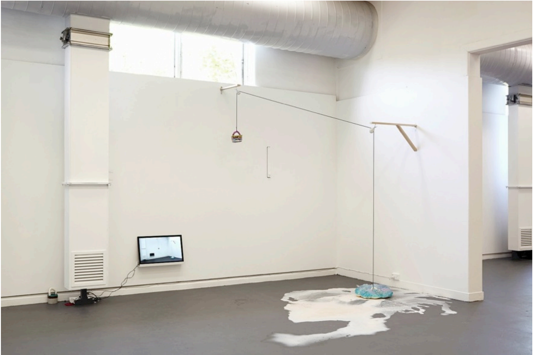
Introspective Paradigms , Installation View, wood, resin, pulleys, rope, foam, MADA NOW, 2015