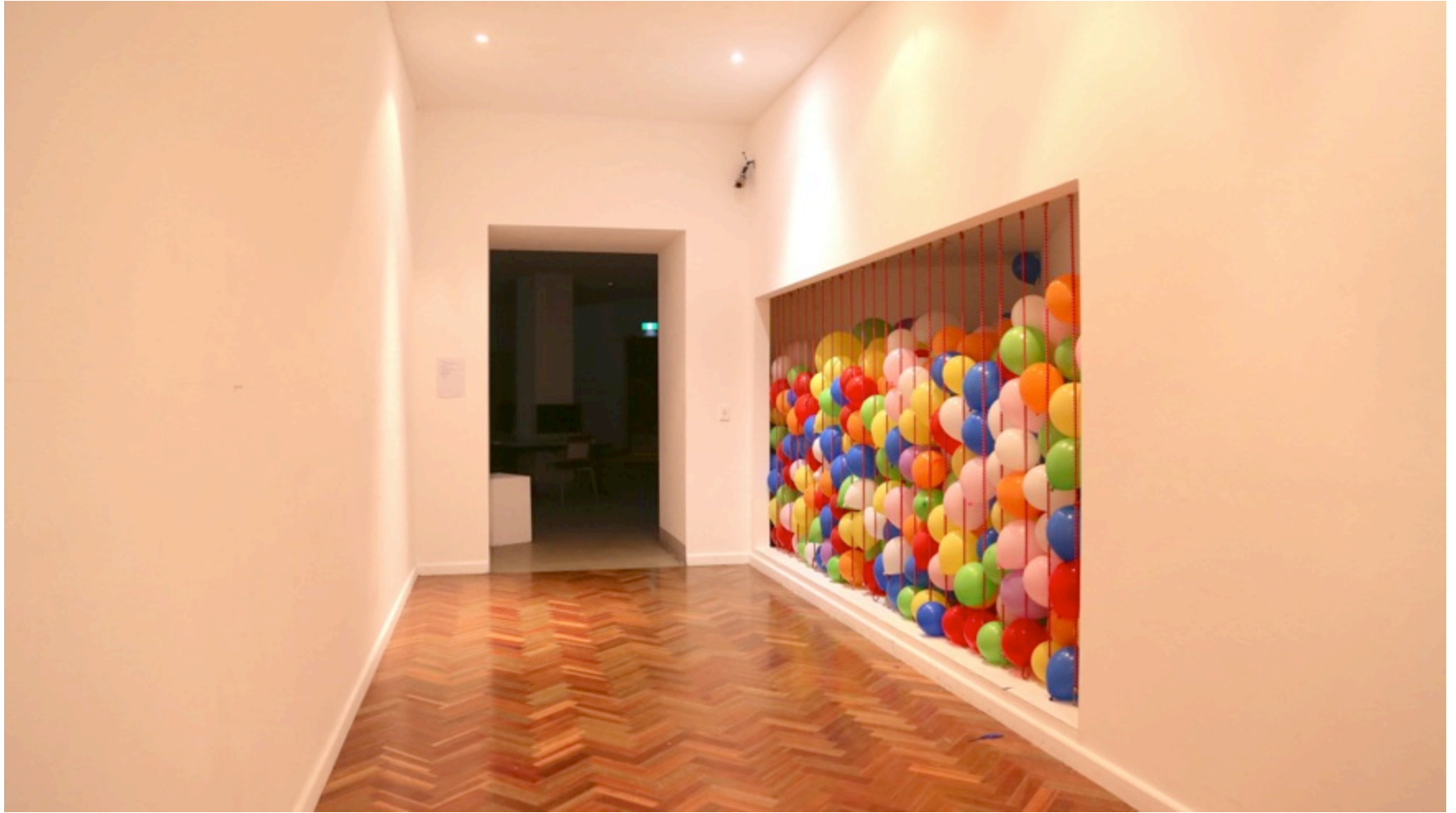
Balloon Installation View, Balloons, hooks, bungee cords, Triangle Space, Building D, 2016