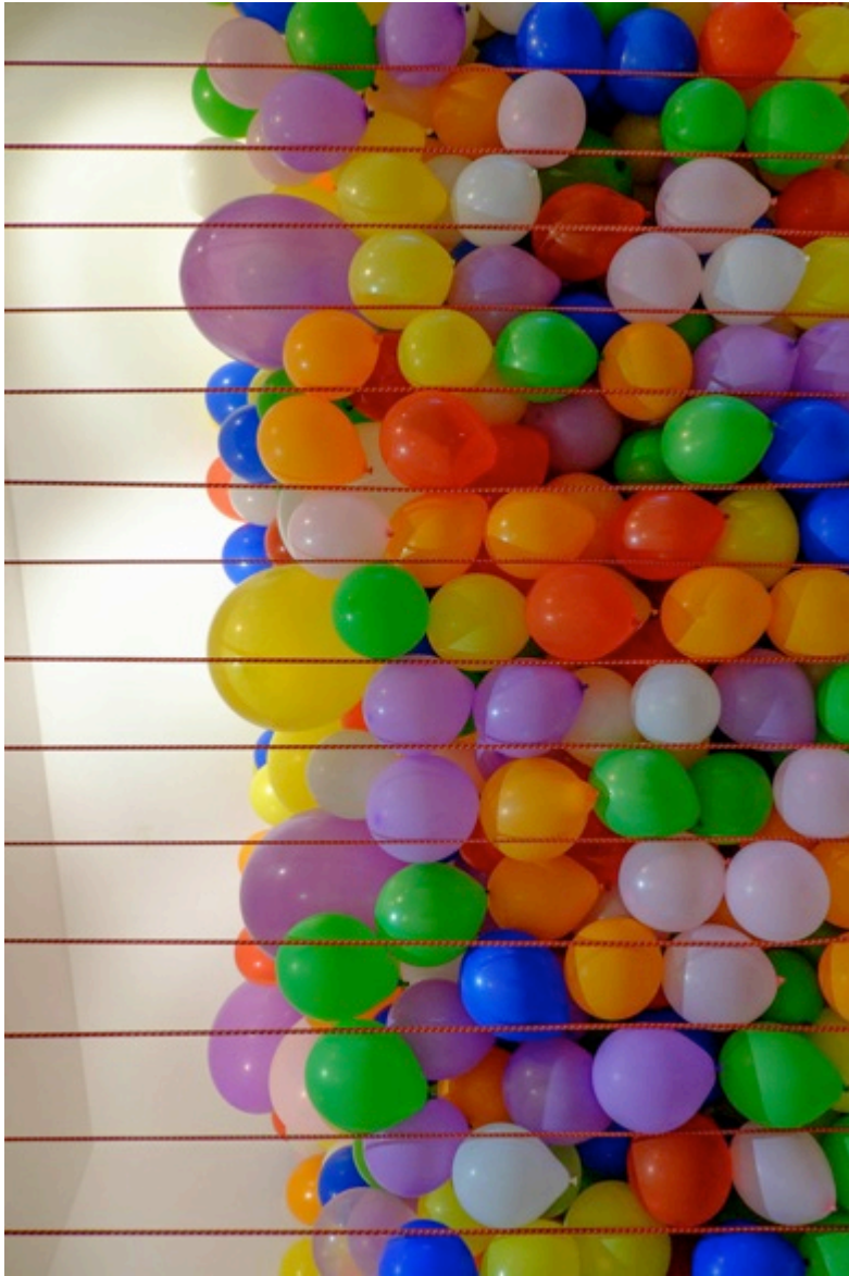
Left: (sideways) Balloon Installation View, Balloons, hooks, bungee cords, Triangle Space, Building D, 2016