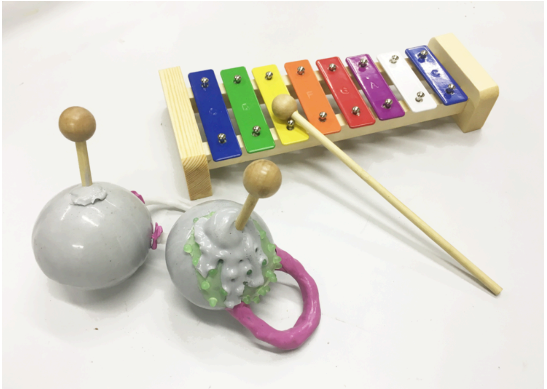
Knockers Proposition A , Found objects, wood, resin, silicon, rubber, wire, 2016